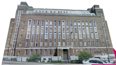
Conference Aston Meeting Suites

Follow the dark green route to find your way to your venue. Don't worry, the venues are no more than 4 minutes' walk from each other.